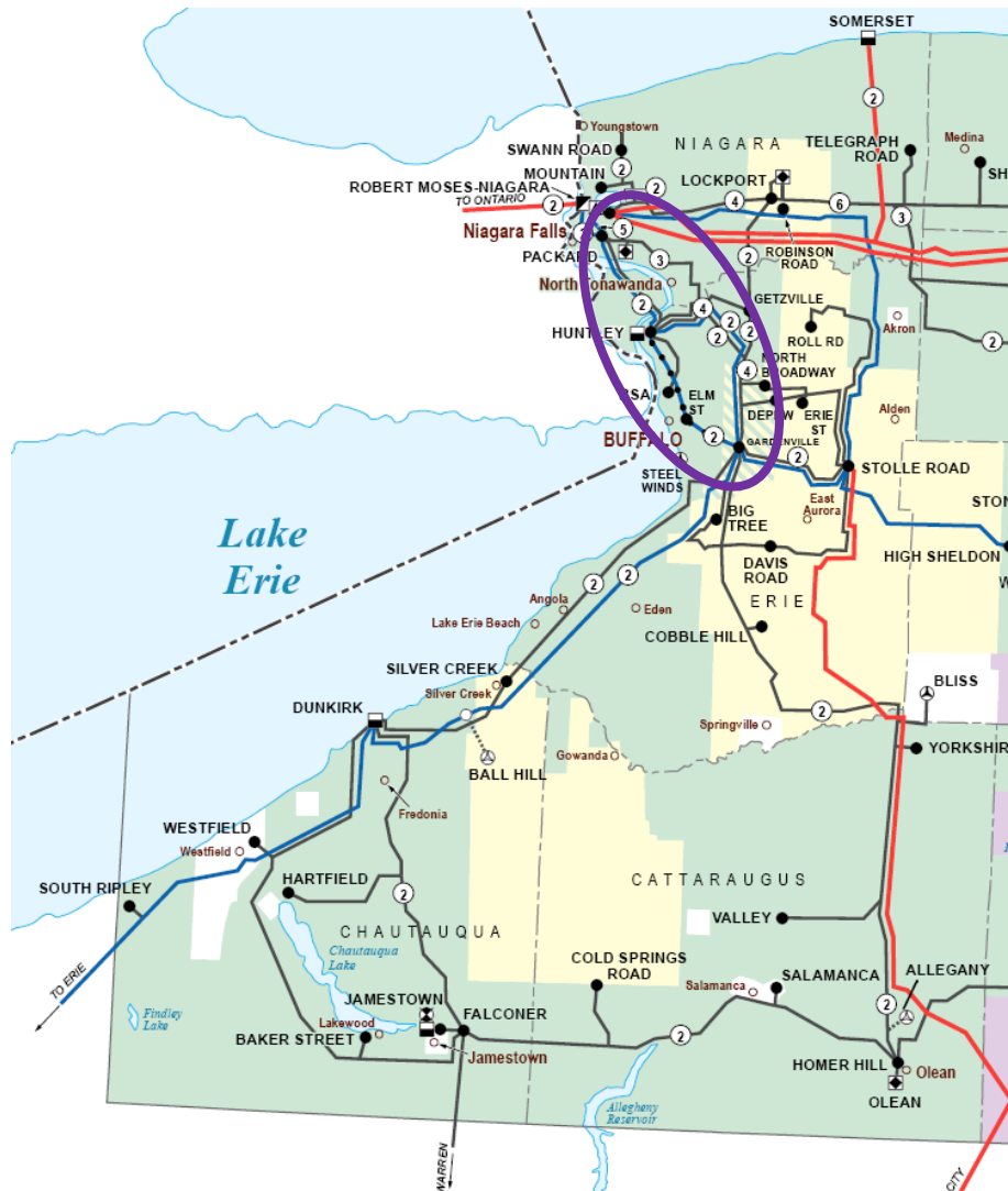
Key: red lines = 345kV; blue lines = 230kV; black lines = 115kV Purple circle = constrained 230 kV lines