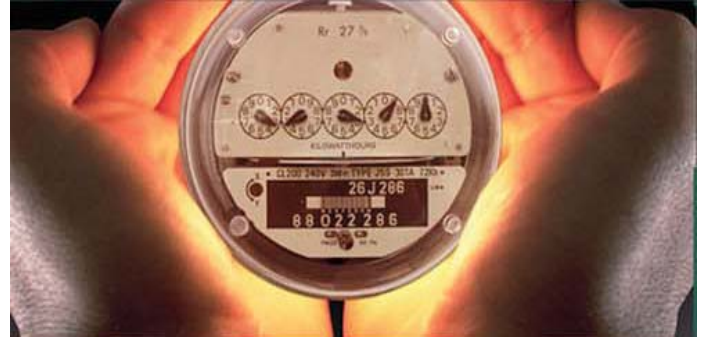
Six-Second & Dispatch Interval Performance Data