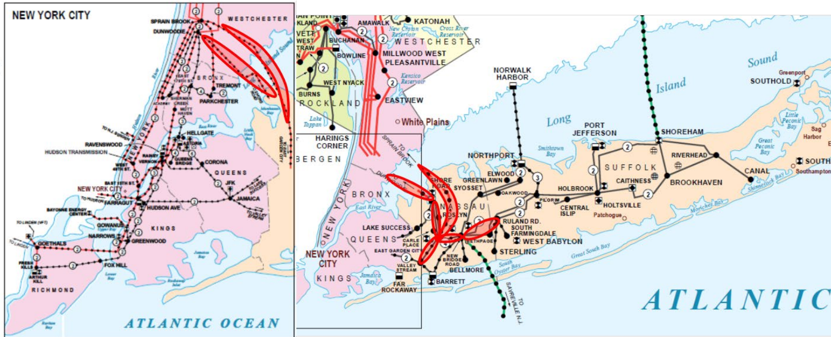
Figure 1: Significant N-0 Constraints. Red shading indicates constraints that occur in the light load conditions.