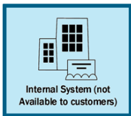
Internal System (not Available to customers)

MIS: Market Information System DRIS: Demand Response Information System ICAP: Installed Capacity TCC: Transmission Congestion Contracts AMS: Automated Market System CSI: Customer Settlement Interface DSS: Decision Support System