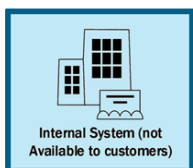
Internal System (not available to customers)

MIS: Market Information System DRIS: Demand Response Information System ICAP: Installed Capacity TCC: Transmission Congestion Contracts AMS: Automated Market System CSI: Customer Settlement Interface DSS: Decision Support System